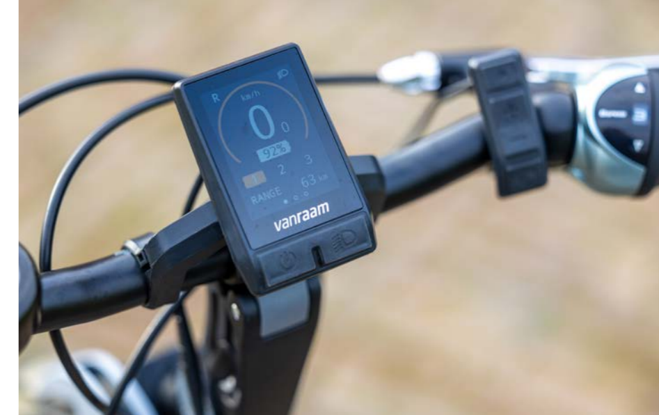
Silent smart display

All our electric bikes are equipped with the Silent smart display. This display consists of a button unit that allows you to easily switch between support modes and an information screen.